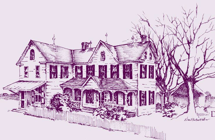
James E. Kirwan Museum, 1889