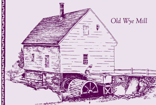
Old Wye Mill

Come visit Queen Anne's County's historic train stations, colonial houses, an operating grist mill, a country store, and churches on six First Saturdays when the County's historic sites jointly open their doors to visitors.