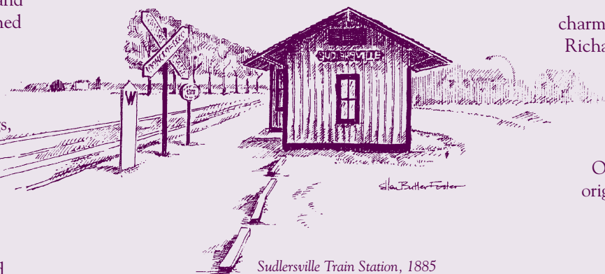
Sudlersville Train Station, 1885